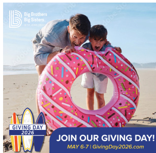
Email Image: Big and Little playing on the beach with a large inflatable donut

Subject: We need you for 2 hours to change a child's life in St. Augustine