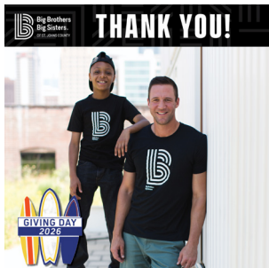
Thank you post: Big and Little in BBBS T-shirt