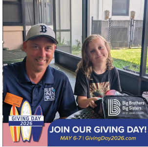
Big and Little eating lunch