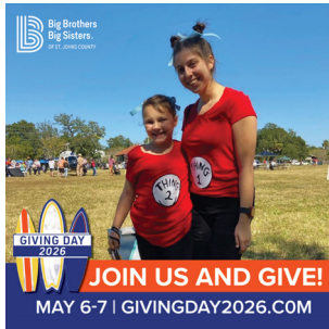
Big and little in Thing 1&2 t shirts