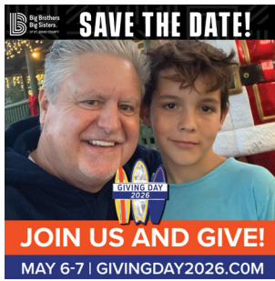
2026 Big and little of the year