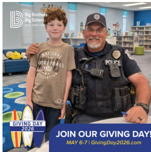
Big-in-Blue and Little

#GivingDay2026 #StJohnsCounty #BigBrothersBigSisters #BBBS #BeABig